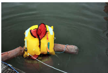
No crotch strap fitted