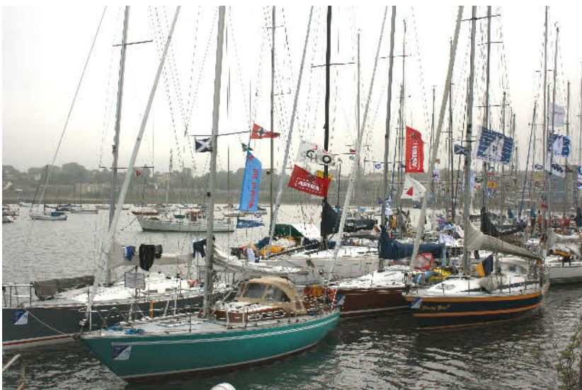
Some of the German racers On Edinburgh Marina Pontoons