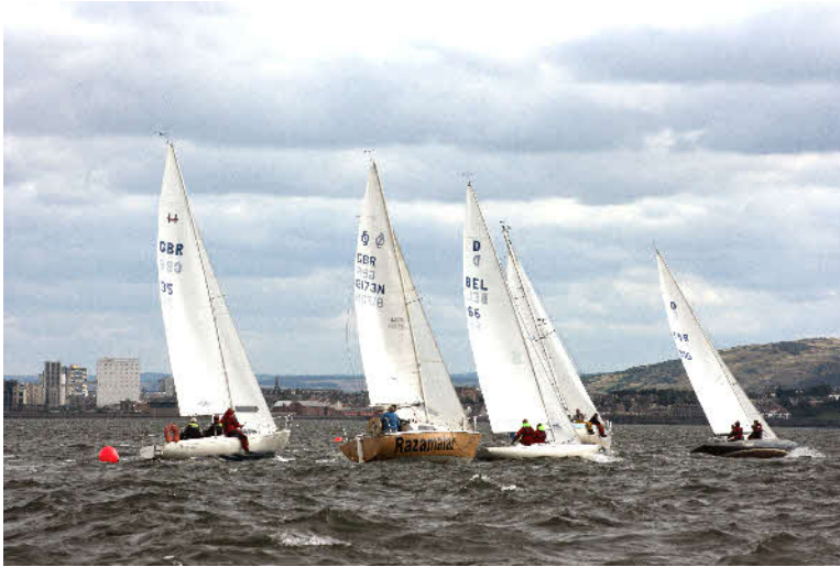
Edinburgh Regatta 2008

After a long winter it is great to have the sailing season stretching out ahead.