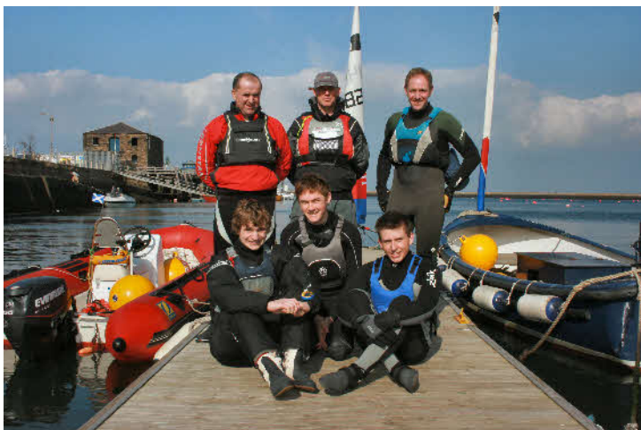
RYA Coaches at Granton